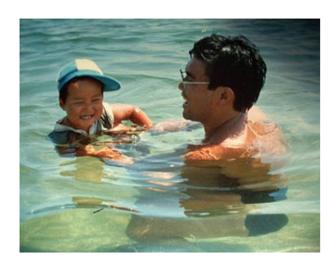
With his Papa