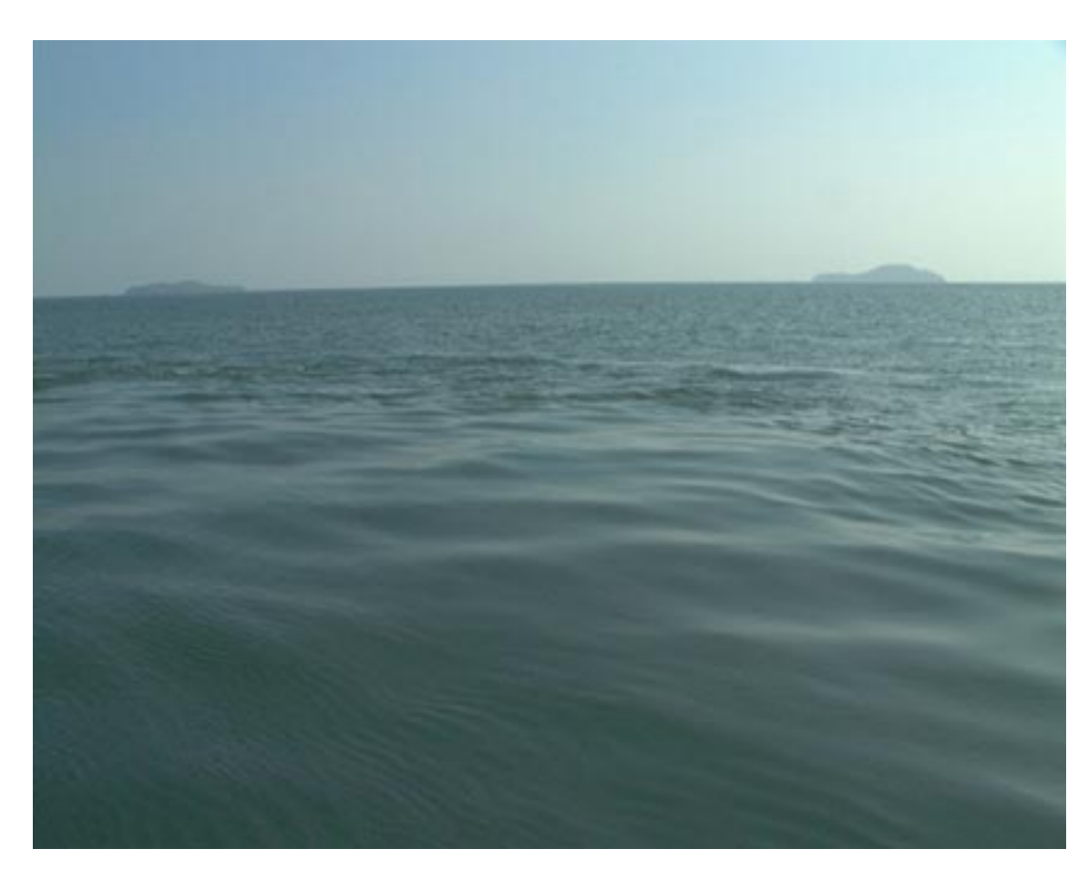
Beautiful Sea Water of ODAGAHAMA