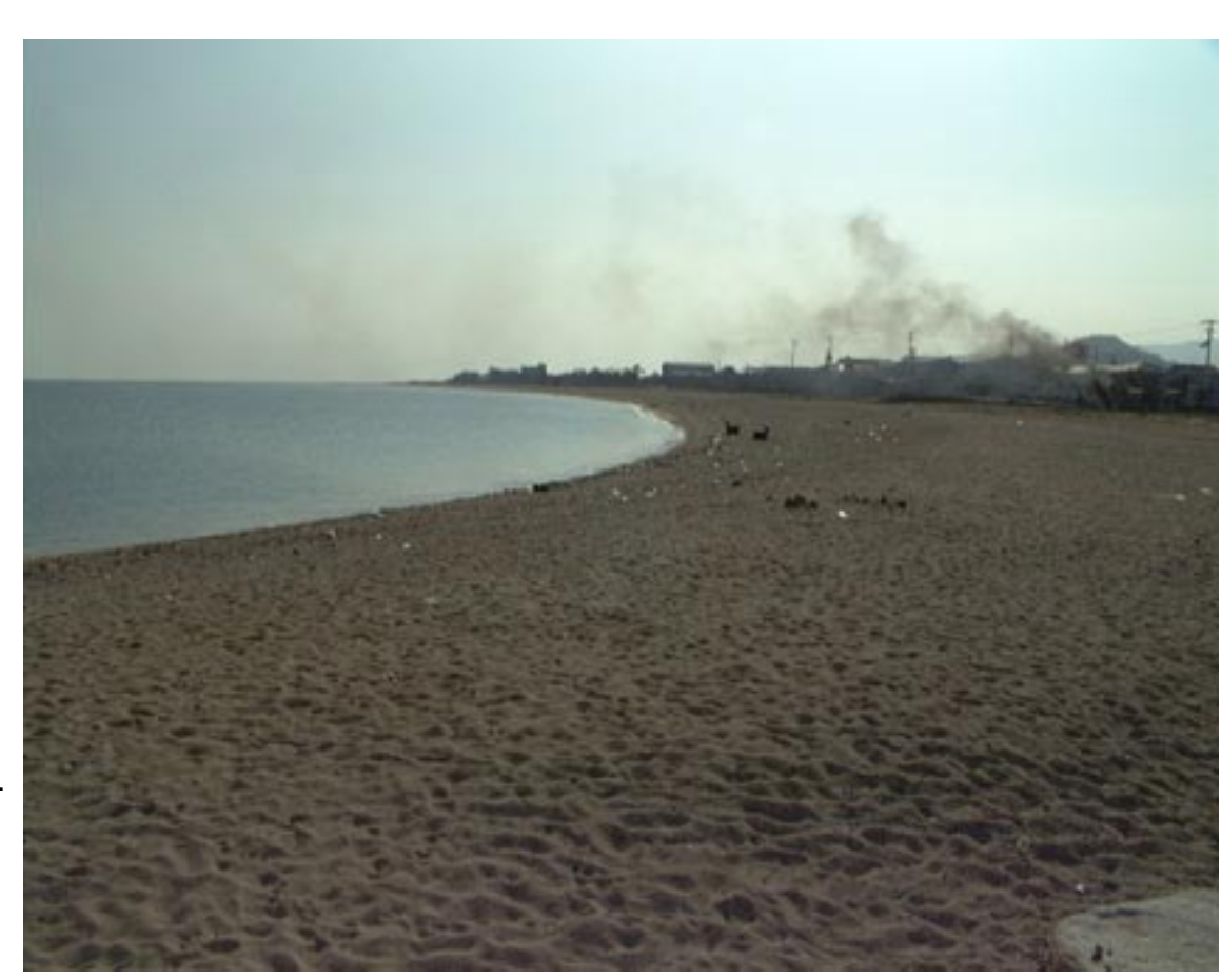
Eastern View of ODAGAHAMA in Winter